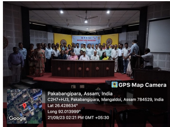
GPS Map Camera Pakabangipara, Assam, India C2H7+HJ3, Pakabangipara, Mangaldoi, Assam 784529, India Lat 26.428634° Long 92.013999° 21/09/23 02:21 PM GMT +05:30