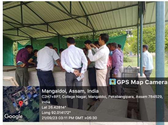
GPS Map Camera Mangaldoi, Assam, India C2H7+8P7, College Nagar, Mangaldoi, Pakabangipara, Assam 784529, India Lat 26.42814° Long 92.014172° 21/09/23 03:11 PM GMT +05:30