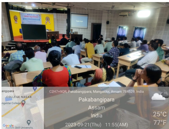
GPS Map Camera Pakabangipara, Assam, India C2H7+9QR, Pakabangipara, Mangaldoi, Assam 784529, India 25°C 77°F 2023-09-21(Thu) 11:55(AM)