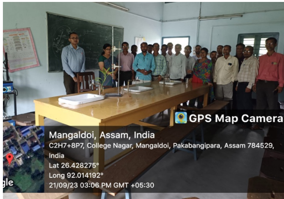
GPS Map Camera Mangaldoi, Assam, India C2H7+8P7, College Nagar, Mangaldoi, Pakabangipara, Assam 784529, India Lat 26.428275° Long 92.014192° 21/09/23 03:06 PM GMT +05:30